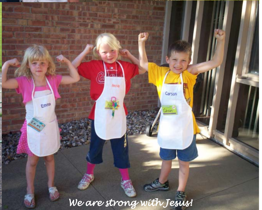
We are strong with Jesus!