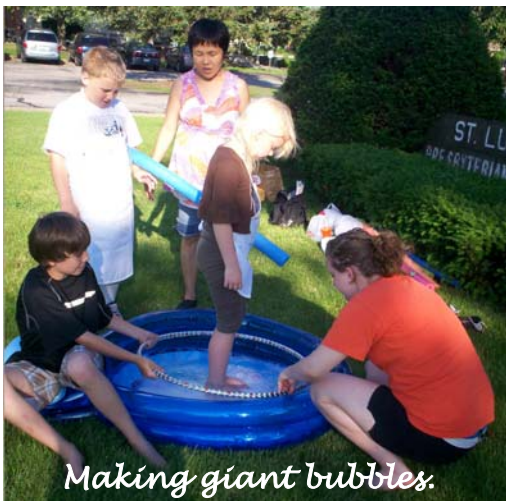
Making giant bubbles.