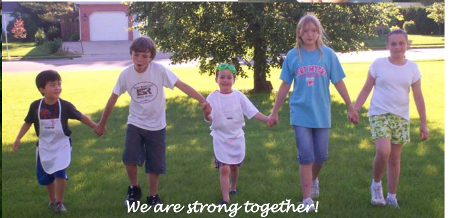
We are strong together!