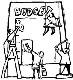
Planning our Budget