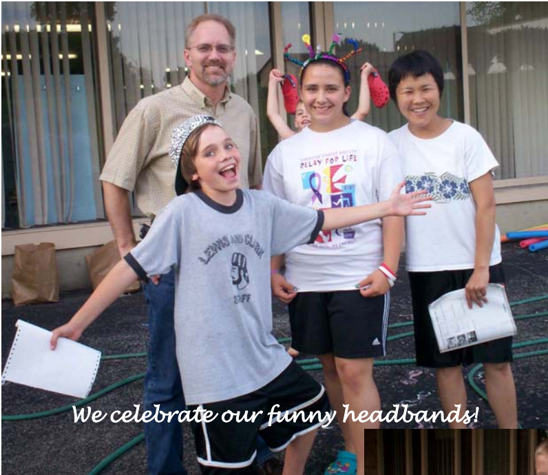
We celebrate our funny headbands!