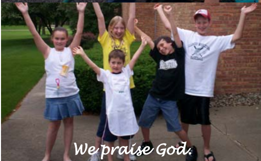
We praise God.