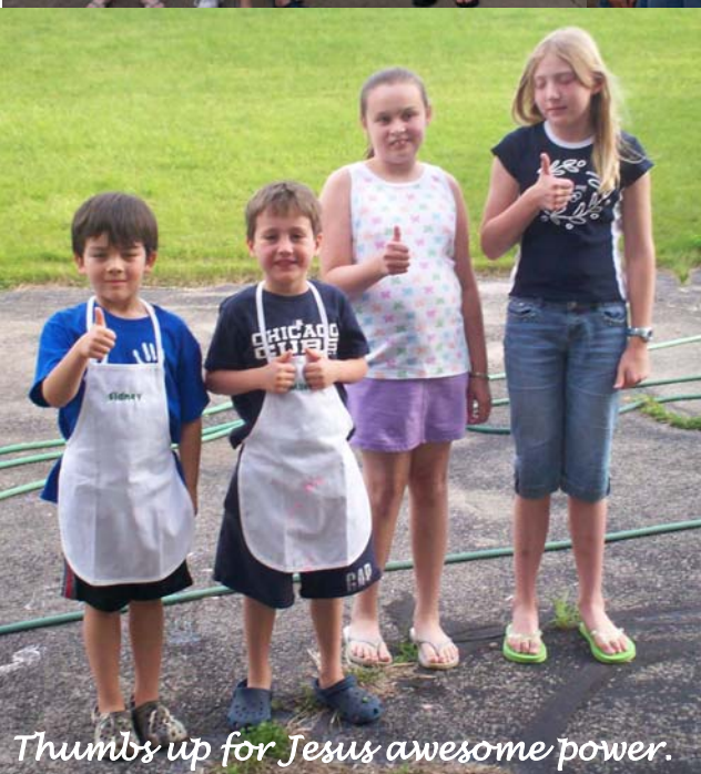
Thumbs up for Jesus awesome power.