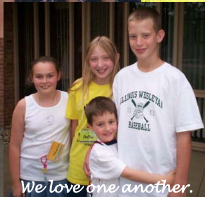
We love one another.